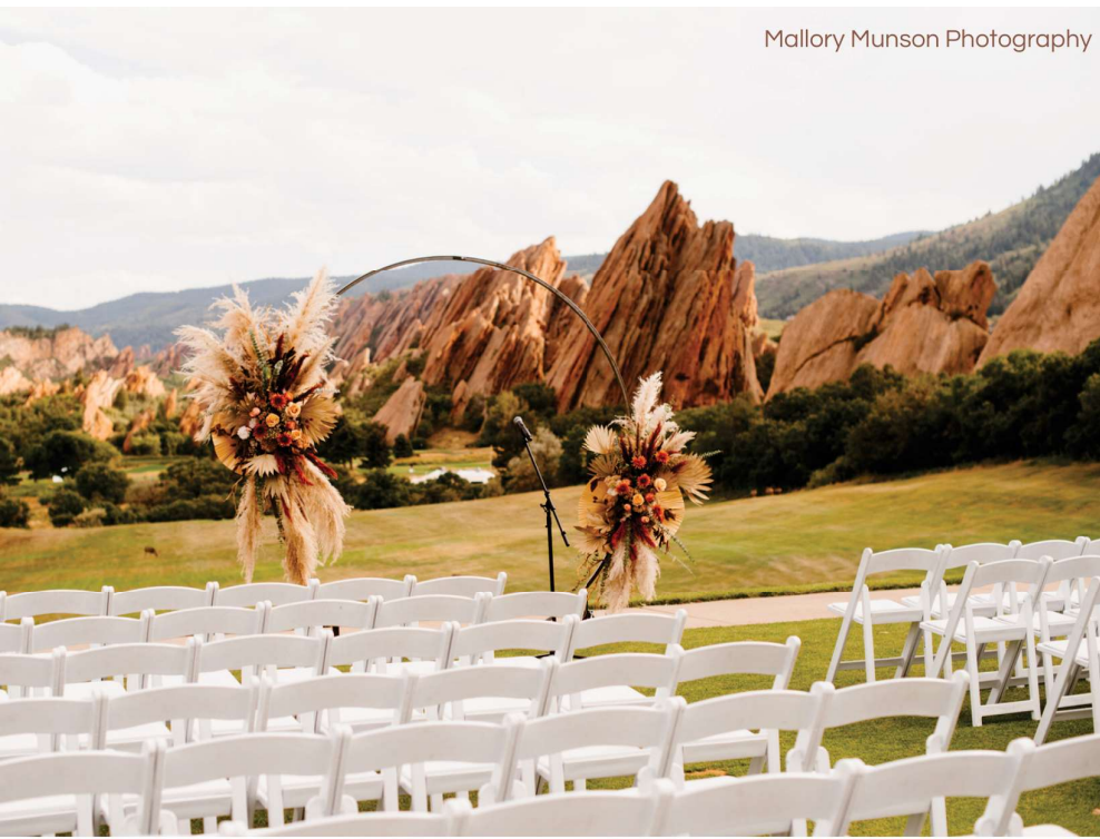
Mallory Munson Photography