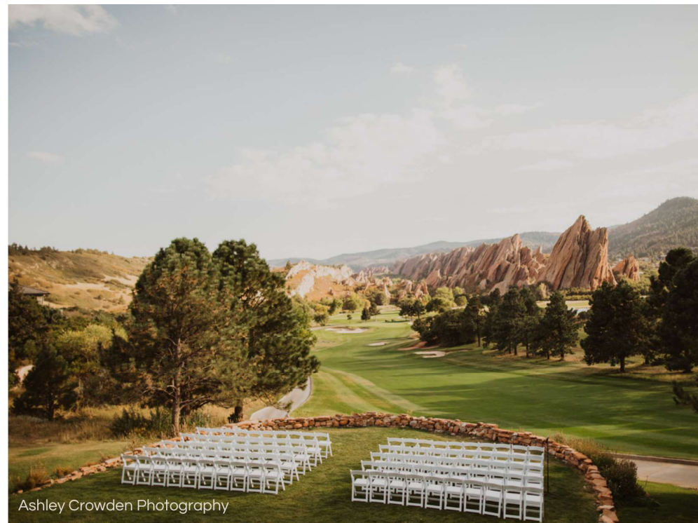
Ashley Crowden Photography

5 Hours Event Time + 2 Hours Access Time + 1 Hour Clean Up Time